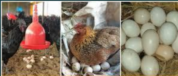
Desi Layer poultry farming

Related Books: - Livestock Farming, Development (Sheep, Pig, Goat, Rabbit), Poultry Farming, Animal, Cattle & Poultry Feed, Fodder, Fisheries and Aquaculture, Fish, Meat, Pork Processing