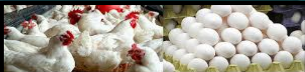
Layer Poultry Farming

Related Project: - Layer Poultry Farming