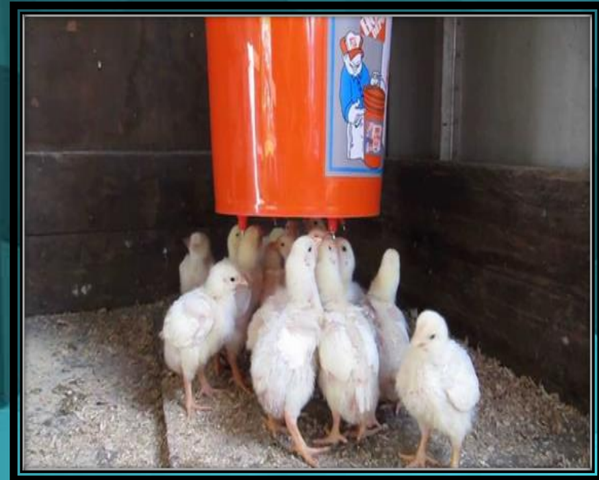
Waterers for chicks